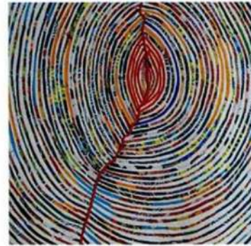
STELLENBOSCH VISIO AUTUMN 2026 75